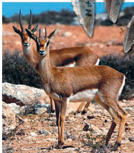
Galloping gazelle. Natufians probably hunted their favorite prey using lunates ( inset ) as arrowheads.