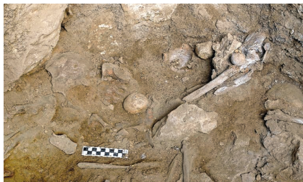
Spirit world. This 12,000-year-old burial at Hilazon Tachtit in Israel might have been that of a shaman woman.