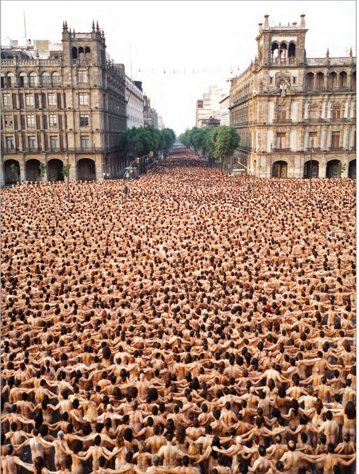
Spencer Tunick - Mexico City installation.