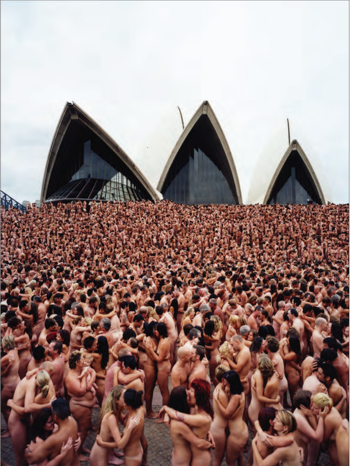
Tunick - Sydney Opera House installation.