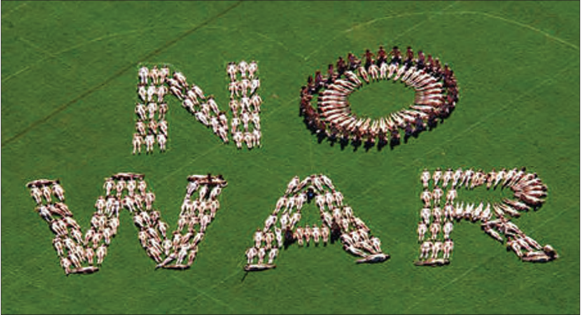
Carrette, 'No War'.

socio-political strategy. We know that an unexpected flash of flesh can have the impact that Shelley attributed to poetry: 'it strips the veil of familiarity from the world' (Shelley 1821, in Douglas-Fairhurst 2011). There are many examples of this use of flesh as surprise, which enables the registering of a point. As illustrations we draw attention to just a couple of them where the revealed body is meant specifically to remind us of our shared interconnected location as physical creatures: one, an anti-war protest of exposed bodies in Sydney in 2003 in which the naked bodies are arranged to themselves spell out 'NO WAR' and the second a political declaration regarding ethical treatment of other animals' bodies.