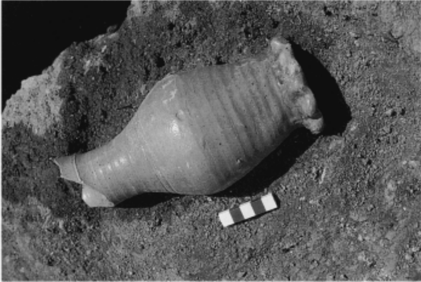
Figure 2.4 Secondary rubbish in a latrine pit.

Size also plays a part in the loss of smaller artefacts. Large coins, for example, are easier to find than smaller ones. In the case of smaller objects, value also is particularly important. More effort will be put into finding a small lost gold coin than perhaps a larger copper-alloy one. Size and value are therefore factors which are important when considering loss. The value is, of course, the value to the person or community losing something, not the archaeologist's estimate of value. A scrap of bone from an ancestor may be of more value to the community owning it than any metal artefacts. If mislaid during a ritual, no stone may be left unturned in attempts to recover the bone scrap.