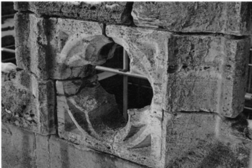
Figure 2.6 Mortar eroded out of medieval masonry through wind action.

Wind can be an agent both of destruction and preservation. Exposed elements of a site, like a masonry tower, may be either continuously or seasonally subjected to wind erosion. Fine particles can be blown off masonry, for example, and this material then acts as sand-blasting on the adjacent bit of masonry. Softer elements, like mortar between the stones, are likely to be abraded first, perhaps loosening stones which then fall off revealing a new surface to wind erosion (Fig. 2.6). All these particles must, however, end up somewhere and if they fall to the ground at another part of the site they may build up a deposit which protects that area from further wind erosion.