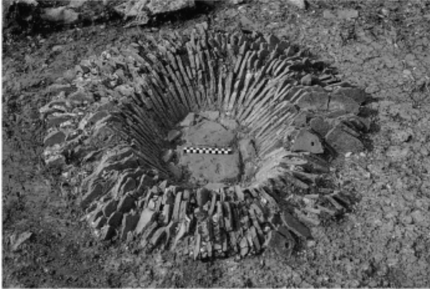
Figure 2.2 Medieval roof-tiles re-cycled in the sixteenth century to make a lead-melting hearth.

flooring or backing for hearths. Figure 2.2 shows medieval roof-tiles from a hall carefully re-used in the sixteenth century to make a hearth for melting lead during the destruction phase in a medieval castle. Of course here again we have the problem that although clearly made as roof-tiles (each has two peg-holes), there is no evidence that they were actually ever used on a roof. They may have been excess tiles, coming straight from the kiln. Clearly, however, they had a primary function and – whether used in that way or not – were put to a secondary use.