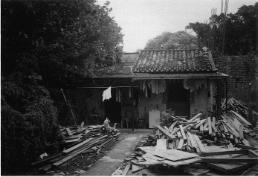
Figure 2.5 Re-usable materials in the process of being scavenged from a deserted building.

far or along a difficult route. The same applies to mobile artefacts. Those that are heavy and easily replaced are more likely to be abandoned than light and scarcer artefacts.