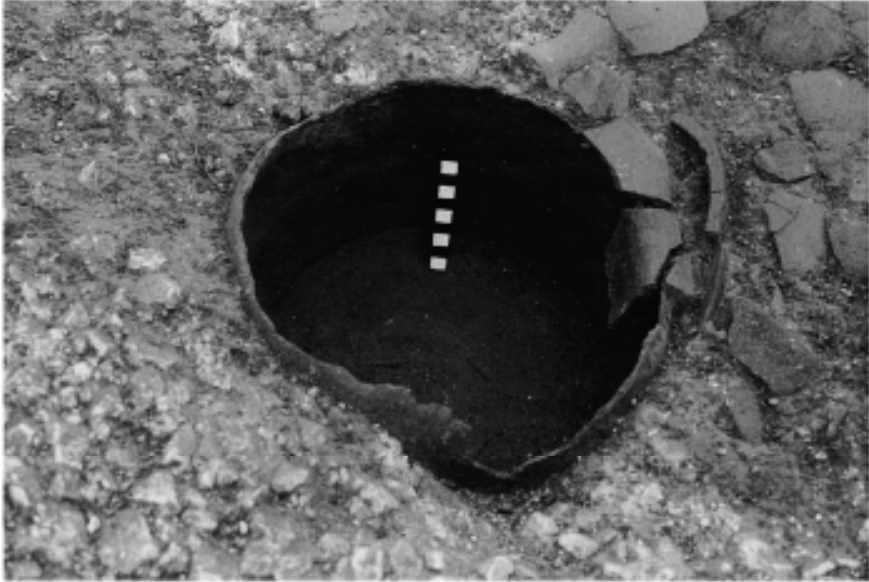
Figure 2.1 Medieval sagging-based cooking pot buried behind the farmhouse on Bullock Down, East Sussex. Re-cycled as a chicken feeder?

pottery being made. The pot, therefore, has a primary use and then a range of secondary uses, ending up being recycled in new pots. Often this process cannot be detected in the archaeological record. There would be no way of telling whether the grog in the new pots had been through this cycle of use or was the remains of kiln wasters that had gone straight from firing to second firing as grog. As a field archaeologist, however, one must be aware of possibilities of secondary use and the recycling of materials.