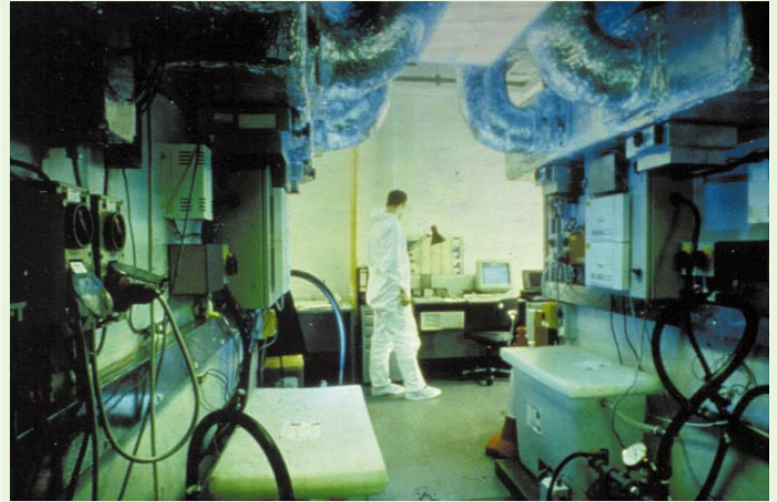
Figure 1 The Ecotron experiment creates model multitrophic community assemblages containing plants, herbivores, parasitoids and decomposers in 16 different chambers. The Ecotron is an ambitious attempt to bridge the scale between field communities and laboratory experiments. (Photographs show the inside of an Ecotron chamber and a technical service corridor between two banks of chambers; courtesy of the Centre for Population Biology, Imperial College at Silwood Park.)

fairly regular waxing and waning of a population's density). Such background population variability, whether driven by biotic or abiotic processes, can provide species with the opportunity to respond differentially to their environment. In turn, these differential species responses weaken the destructive potential of competitive exclusion.