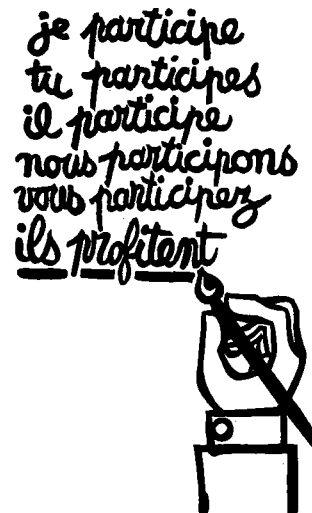
FIGURE 1 French Student Poster. In English, I participate; you participate; he participates; we participate; you participate . . . They profit.

There is a critical difference between going through the empty ritual of participation and having the real power needed to affect the outcome of the process. This difference is brilliantly capsulized in a poster painted last spring by the French students to explain the student-worker rebellion. 2 (See Figure 1.) The poster highlights the fundamental point that participation without redistribution of power is an empty and frustrating process for the powerless. It allows the power-holders to claim that all sides were considered, but makes it possible for only some of those sides to benefit. It maintains the status quo. Essentially, it is what has