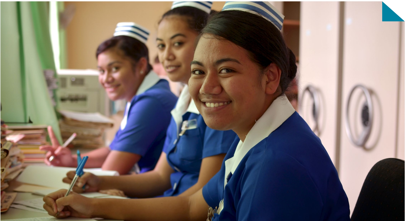
Broadband internet has significantly improved medical services at Tonga's Vaiola Hospital.