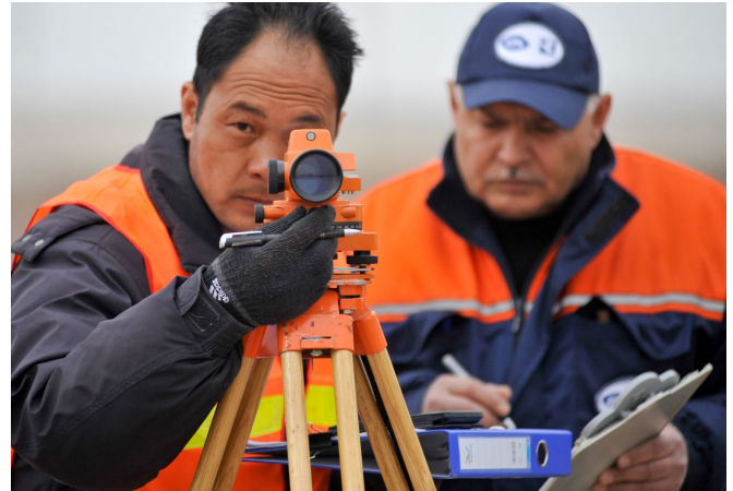
Construction of the new Uzbekistan-Khazakstan Highway has boosted regional trade.

The introductory section examines the major approaches to public administration and how these have shaped the public sector reform agenda in developing countries, highlighting the factors that have impeded the implementation and impact of these reforms. The second section examines the changing nature of public administration, distinguishing between three models of public management and identifying their key attributes and limitations. The following section