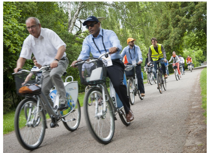
More and more cities are providing cycles on rent as a means of public transport.

whole-of-government initiatives have tended to complement rather than supplant NPM reforms in their entirety, in effect rebalancing the pure NPM model (Christensen and Laegreid, 2007a, 2007b). In this respect, the creation of the UK Prime Minister’s Delivery Unit under the Labour government in 2001 sought to drive up delivery standards and results in priority policy areas through greater co-ordination, clarity on goals, the formulation of delivery plans, and continuous measurement of performance. The delivery unit approach has since gained traction in various parts of the world as a means of realizing the benefits of a more joined-up approach to policy implementation (Barber, 2008; Ho, 2012).