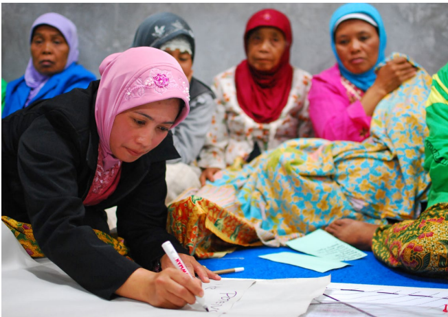
Women discuss the reconstruction of their village at a community meeting in Yogyakarta, Indonesia.