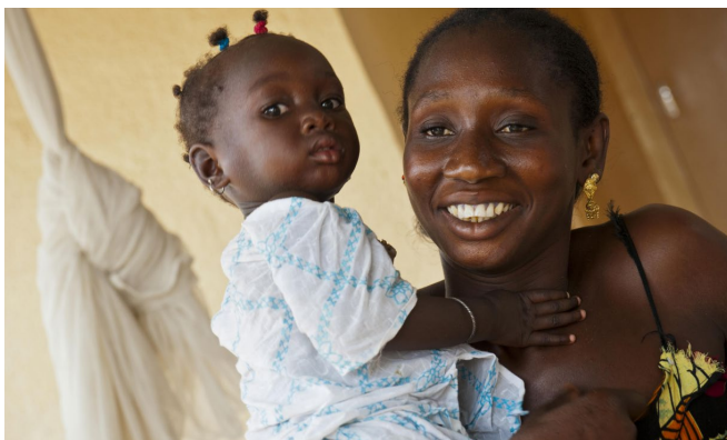
The first child born at a new shared primary healthcare facility in Bicole village, Fatick district, Senegal.