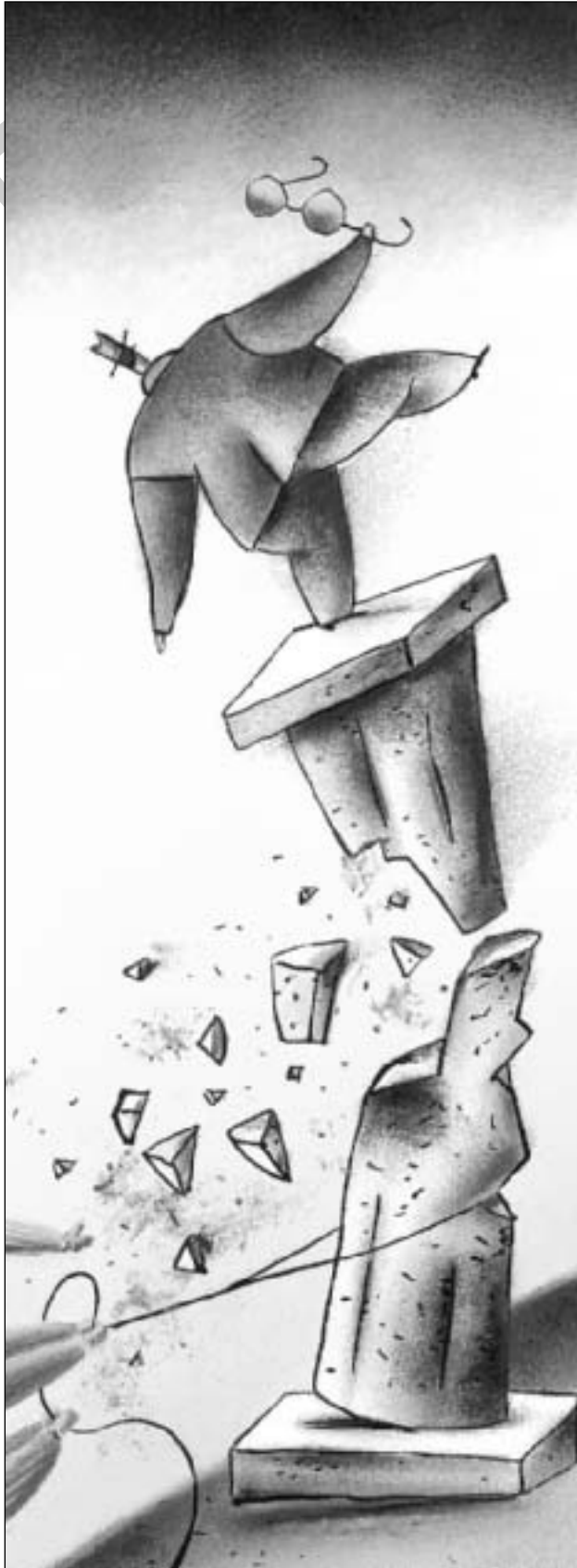
While celebrating a win is fine, declaring the war won can be catastrophic.

When it becomes clear to people that major change will take a long time, urgency levels can drop. Commitments to produce short-term wins help keep the urgency level up and force detailed analytical thinking that can clarify or revise visions.