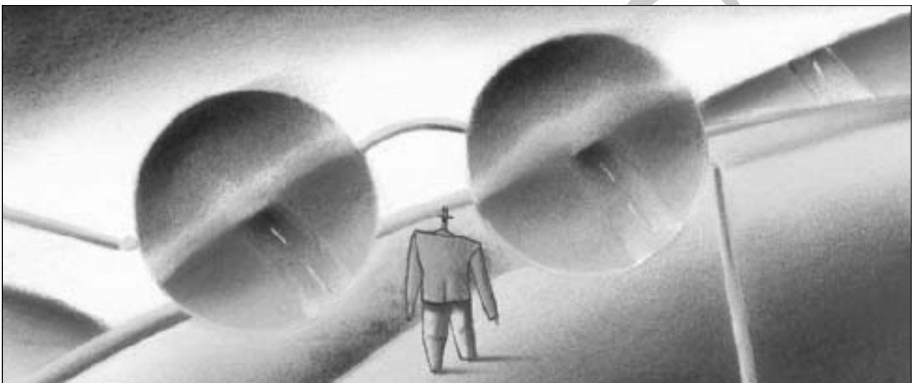
In failed transformations, you often find plenty of plans and programs, but no vision.

Companies that fail in phase two usually underestimate the difficulties of producing change and thus the importance of a powerful guiding coalition. Sometimes they have no history of teamwork at the top and therefore undervalue the importance of this type of coalition. Sometimes they expect the team to be led by a staff executive from human resources, quality, or strategic planning instead of a key line manager. No matter how capable or dedicated the staff head, groups without strong line leadership never achieve the power that is required.